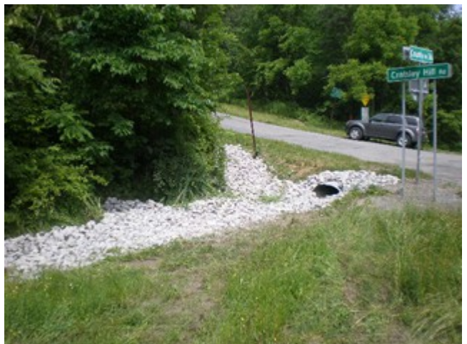
After: Rip-rap slows water, reduces erosive force, filters sediment from the water.