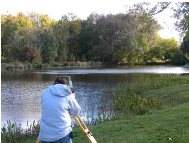
Surveying the Lagoon