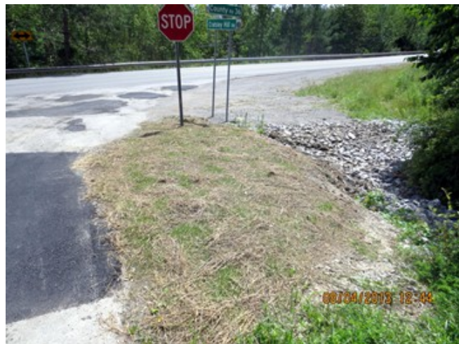
After: Seeded and mulched, grass is sprouting.