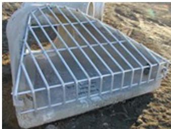
Pictured: Debris guard for a culvert HAAALA Industries

Ontario County SWCD will secure the necessary permits for the work. The cooperating entities will contribute to the in-kind match necessary to secure funding.