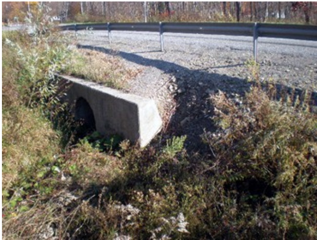
Before: Erosion from road side runoff, culvert collapsing into ditch.