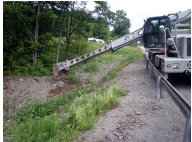
During: Reshaping drainage.