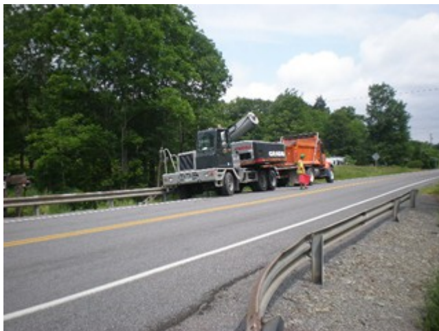
During: Ontario County DOT equipment and staff at work.