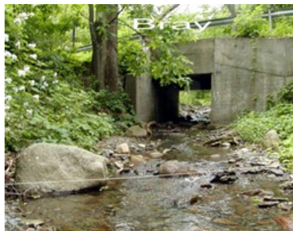
Bray Gully